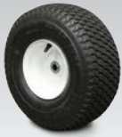
15" Pneumatic Tire