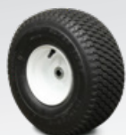
15" Turf Tire