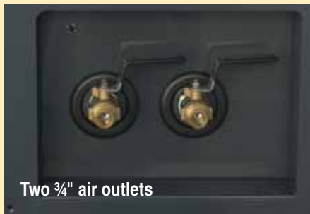
Two 3/4" air outlets