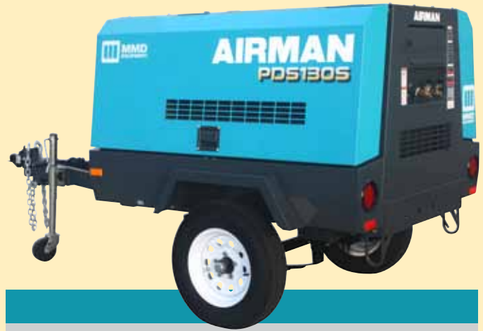
PDS130S-6B4 130 scfm • Tier 4i Shibaura Diesel Engine