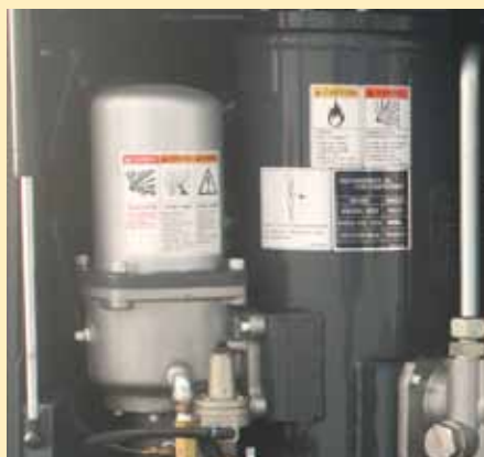
Externally Mounted Separator Filter — Located exterior to the tank and easily serviced by hand for decreased maintenance costs and downtime.

Lockable gullwing doors and lockable control panel cover; LED tail lights provide increased towing visibility in all weather conditions and are enhanced by multiple side and rear reflectors.