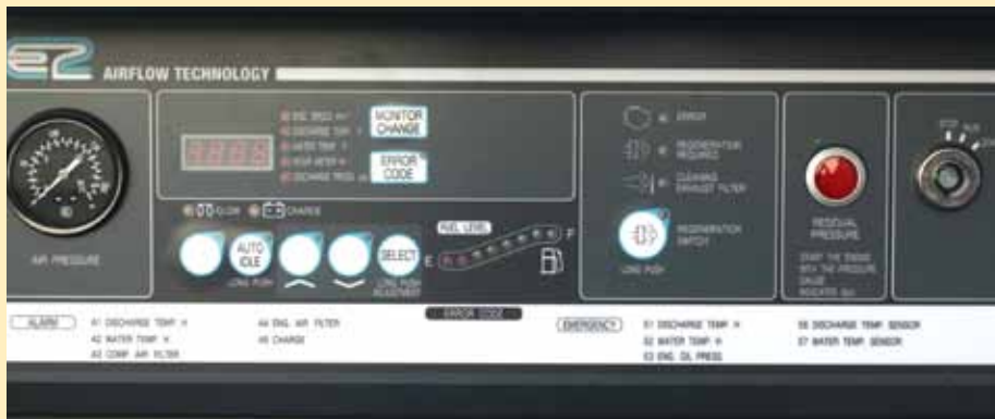
Diagnostic Control Panel — Monitors low fuel level, battery, fuel filter, engine oil filter, water temperature, compressor air filter, oil pressure, discharge air temperature and auto idle.