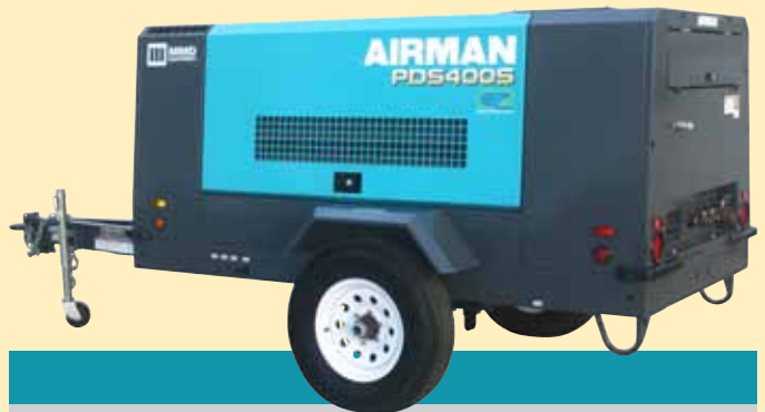
PDS400S-6C3 400 scfm • Tier 3 Flex Isuzu Diesel Engine