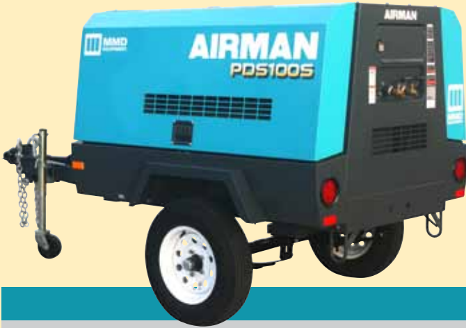
PDS100S-6B4 100 scfm • Tier 4i Shibaura Diesel Engine

A full range of sizes for any application.