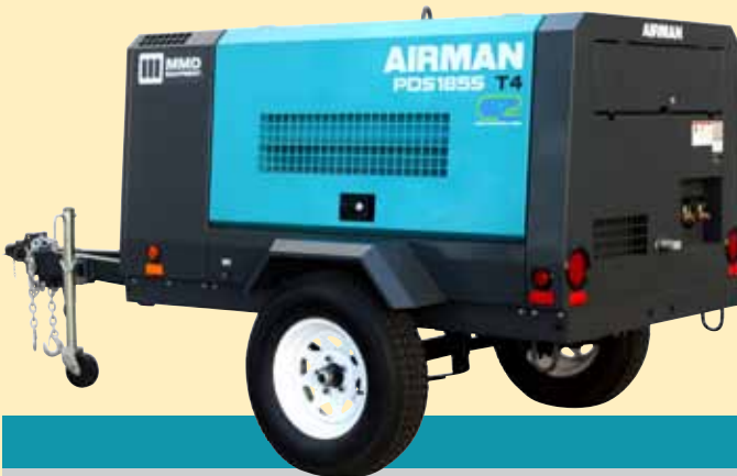
PDS185S-6E1 185 scfm • Tier 4F Yanmar Diesel Engine