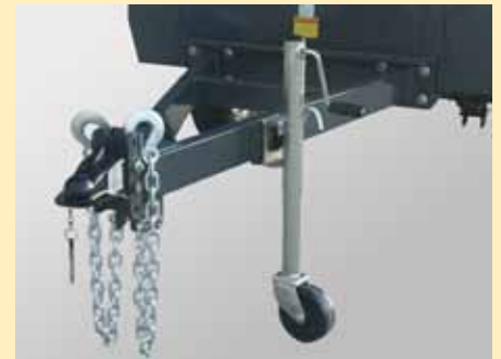
Greater Towing Stability — A wider stance, up to 15" tires, a re-engineered lower center of gravity, heavy duty leaf springs and a rugged “A” frame draw bar provide even greater strength and stability when towing.