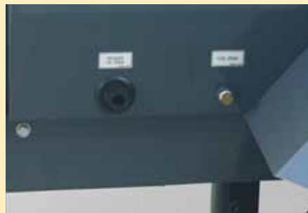
Exterior Drains — Simplify maintenance; the receiver oil, engine oil and fuel drain are independent ports conveniently located on the exterior.