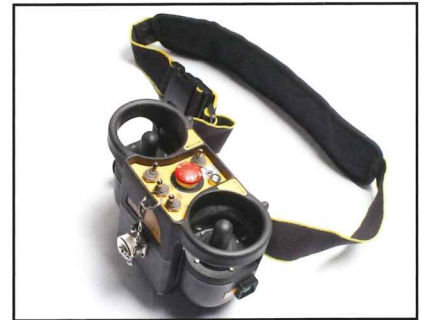
Light weight, dual function cable / radio remote control is easy and safe to operate.