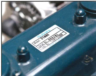
Water cooled Kubota engine with ECOMODE (Fuel Saver).