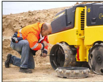
Easy installation of standard bolt-on drum extensions increases compactor versatility.