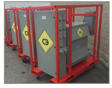
Temporary Portable Power Distribution and Breaker Panels