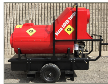
Cart-mount Indirect Fired Heaters Available in Oil/Diesel Fired or LPNG From 200K to 600K BTU