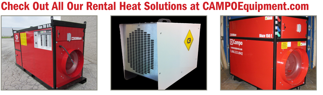
Skid/Caster Mount Electric Heaters Blaze 60KW and Blaze 150KW