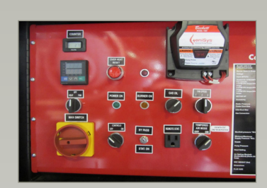
User Friendly control panel, incoming voltage meter and digital thermostat allow efficient heat solutions!