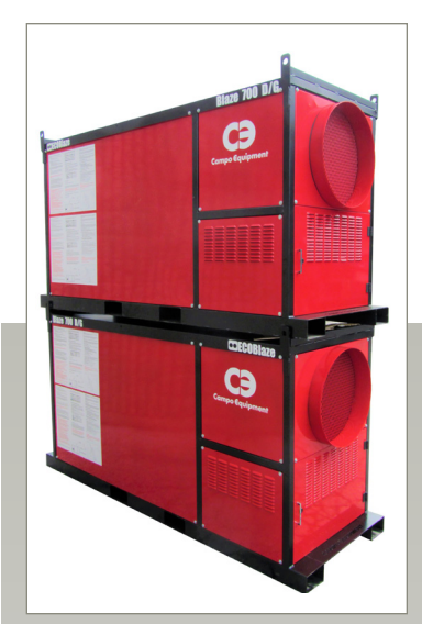
All Campo Skids come with fork pockets, lifting eyes and are stackable for efficient off-season storage!

AND, call us anytime for technical assistance 24/7! Fleet With CAMPO Heaters!