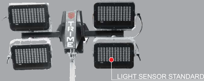
LIGHT SENSOR STANDARD